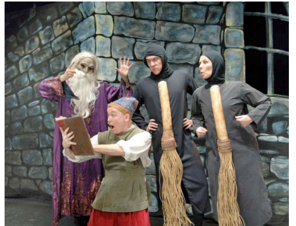
The Sorcerer's Apprentice