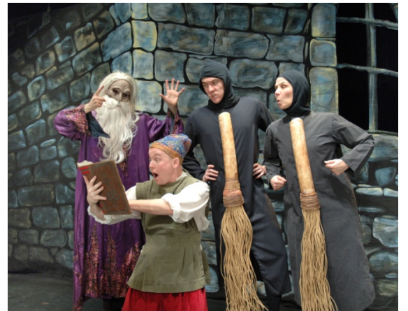
The Sorcerer's Apprentice