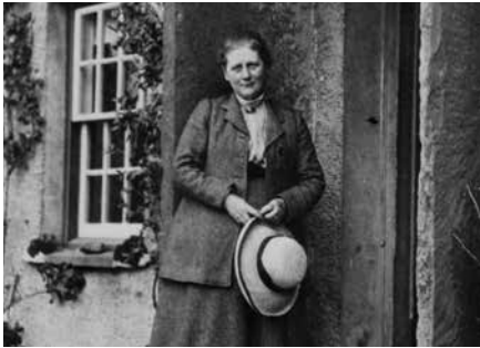
Picture of Beatrix Potter

Beatrix Potter is known throughout the world for her beloved animal characters and inventive tales. The particular pleasure of her stories is their truthfully humorous observation of animals and celebration of the natural world. She combined exquisite drawings with imaginative, witty and highly original story-telling. Born in 1866, Beatrix Potter came from an upper middle-