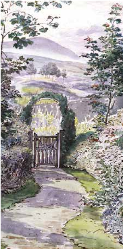
The Garden at Little Ees Wyke, painted by Beatrix Potter in 1902.