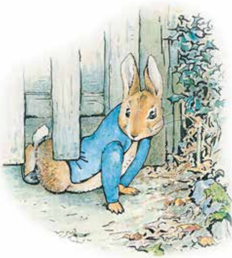
Peter sneaking into the garden

Our production is based on three of Beatrix Potter's "rabbit tales": The Tale of Peter Rabbit , The Tale of Benjamin Bunny and The Tale of Mr. Tod . Beatrix Potter wrote and illustrated over 24 tales and some of her most popular stories featured rabbits. When Enchantment Theatre decided to make a play based on some of Beatrix Potter's stories, we wanted to use the tales about Peter Rabbit and his family; not only are they delightful adventures, filled with humor, bravery and loyalty, but these stories are remarkably true to both animal and human nature. We recognize ourselves in Peter, Benjamin and Flopsy and are also keenly aware of the dangers they face as rabbits, both from Mr. McGregor, the farmer and Mr. Tod, the fox. Ms. Potter's stories are told with humor and wit, combined with a deep appreciation for her character's strengths and foibles. Her gorgeous illustrations perfectly evoke her animal characters and the English countryside, as they beautifully support the storytelling.