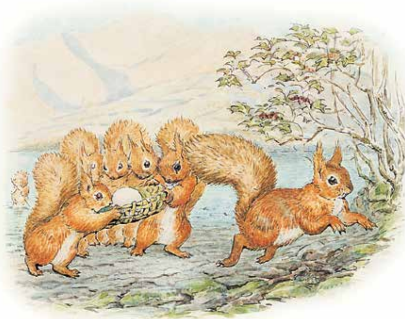
Squirrel Nutkin and friends