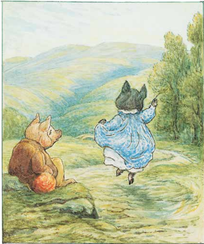
Piggling Bland and Pig-wig