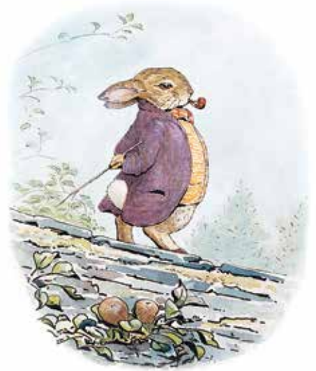
Mr. Benjamin Bouncer

With delightful derring-do, Peter hilariously pits the badger and fox against one another and rescues the baby bunnies. The fox and the badger chase each another off into the woods and Benjamin and Flopsy are joyously reunited with their children. Peter is praised for his bravery and the rabbits travel home to Mr. Bouncer, who is forgiven for his blunder. Squirrel Nutkin and Mrs. Tiggy-Winkle join the family for a country dance, celebrating the return of the babies and Peter's return to the family fold.