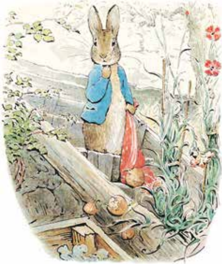
Peter Rabbit in Mr. McGregor's garden

At the beginning of the play, we meet the characters in our story: Peter Rabbit is grown-up and has his own garden. Peter is easily frightened and avoids anything that smacks of danger or adventure.