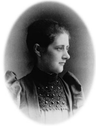
Picture of Beatrix Potter