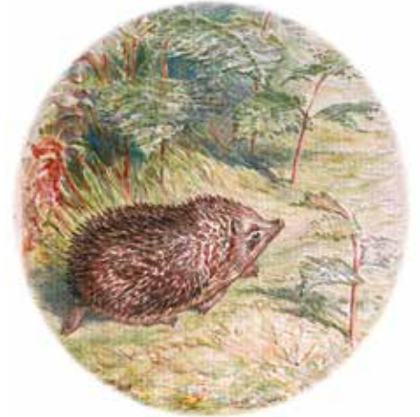
Mrs. Tiggy-Winkle was a hedgehog!

Today, when so many children ignore the natural world and have their eyes glued to screens, robotic gadgets, and other electronic devices, the fauna and flora that Beatrix Potter loved so much go unheeded. Her exemplary life, during which she eschewed self-pity, and her crisp forthright picture stories, leavened with that marvelously wry sense of humor, matter more than ever. When we revisit them and introduce children to them (there are more than thirty), they re-attach us to pulsating out of doors life, to gardens, brooks, and woods, to tender, trenchant, sometimes cruel lessons, and to the wonder of our precarious place in it all.