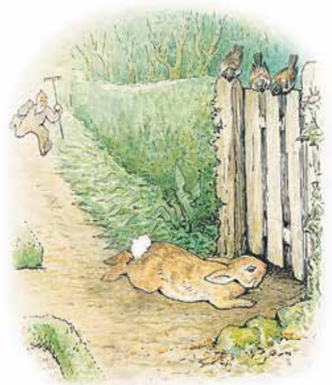
Peter escapes Mr. McGregor