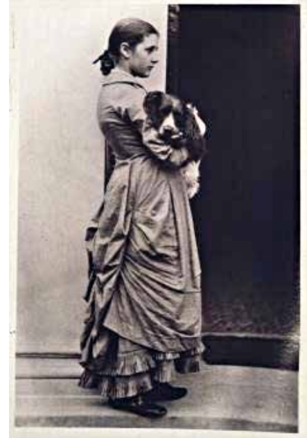
Young Beatrix Potter courtesy of the Beatrix Potter Society

Beatrix Potter had a solitary girlhood. In keeping with the mores of her day, girls were not permitted to go to school but were tutored at home and not encouraged to play with children from other families. As Unitarian Dissenters, moreover, the Potters were consigned to the margins of Anglican London society, and this may have contributed to her shyness and social awkwardness. Like so many Victorian girls and women of her class, she was not encouraged to grow up. She lived with her parents well into her forties. She had no money of her own and not a shred of external independence. She wrote that, by age 28, she had never been anywhere by herself. With her parents, she moved seasonally from city to country and back, and in relation to them, she remained a child. We do know, however, that despite her dutiful demeanor and outward compliance, she felt rebellious, for she kept a coded journal and wrote many letters. Qualities she gleaned from the conditions of her personal life, from her repressive epoch, and from her close observations of nature found their way into her children's books and lent them their staying power.