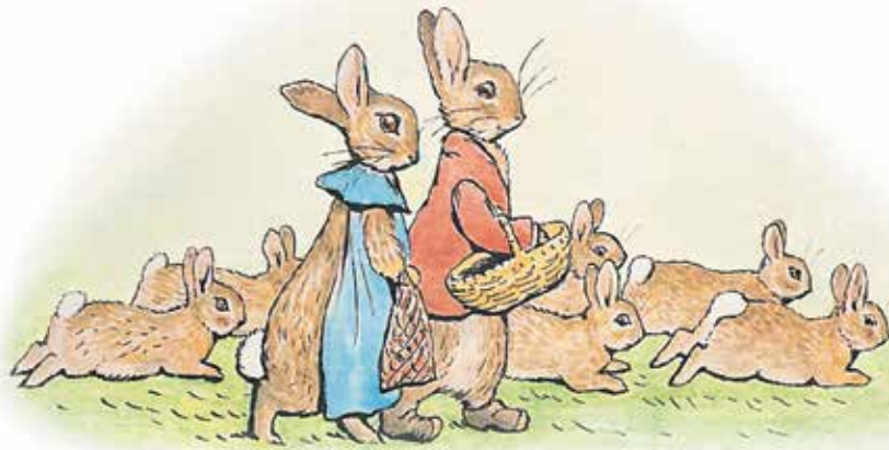
Flopsy, Benjamin and bunnies

As our play unfolds, Tommy Brock steals the baby bunnies while they're under Mr. Bouncer's care. Benjamin decides to set off to track the badger and find his children, and he asks Peter to join him on his quest. But Peter refuses, reminding Benjamin that he's never recovered from his frightening experience in Mr. McGregor's garden. Suddenly the lights dim, the scenery changes and the cousins are sent back to the past. The lights come up on Peter's mother, Mrs. Rabbit, his three sisters and a younger Peter in a flashback sequence that recounts Peter's escapade in Mr. McGregor's garden. Mrs. Rabbit warns Peter