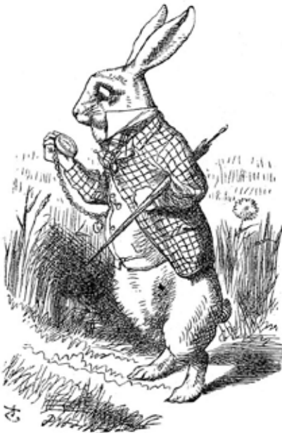
The White Rabbit from Alice in Wonderland by John Tenniel

First and foremost, Beatrix Potter created the most beloved rabbit of all time. Just picture Peter with his cottontail, whiskers, and pale blue jacket; does a smile creep involuntarily across your face? Who created this curious, naughty, greedy, clever, brave, and irresistibly lovable animal?