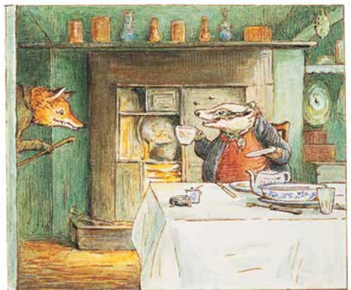
Mr. Tod and Tommy Brock