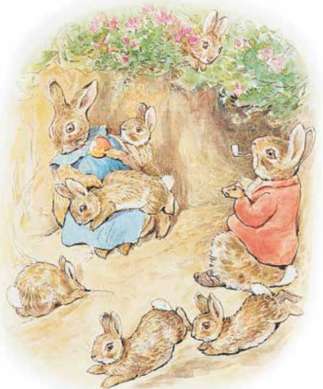
Flopsy, Benjamin and Bunnies

Appreciation: Applause is the best way for an audience in a theater to share its enthusiasm and to appreciate the performers. At the end of the program, it's customary to continue clapping until the curtain drops or the lights on stage go dark. During the curtain call, the performers bow to show their appreciation to the audience. If you really enjoyed the performance, you might even thank the artists with a standing ovation!