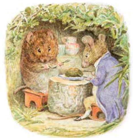
Timmy Willie and Johnny Town-Mouse