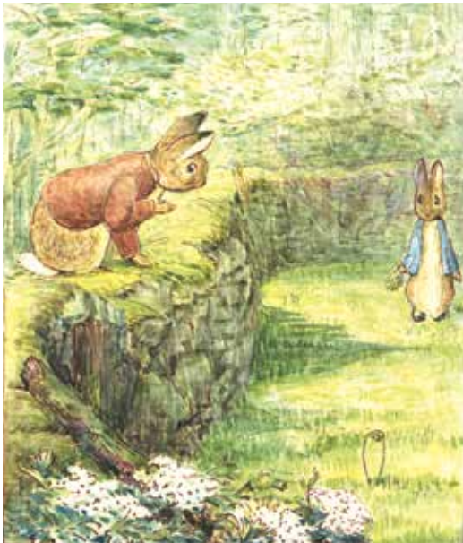
Benjamin Bunny and Peter Rabbit