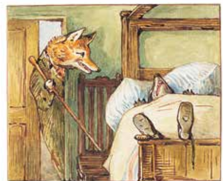
Tommy Brock snoring in Mr. Tod's bed