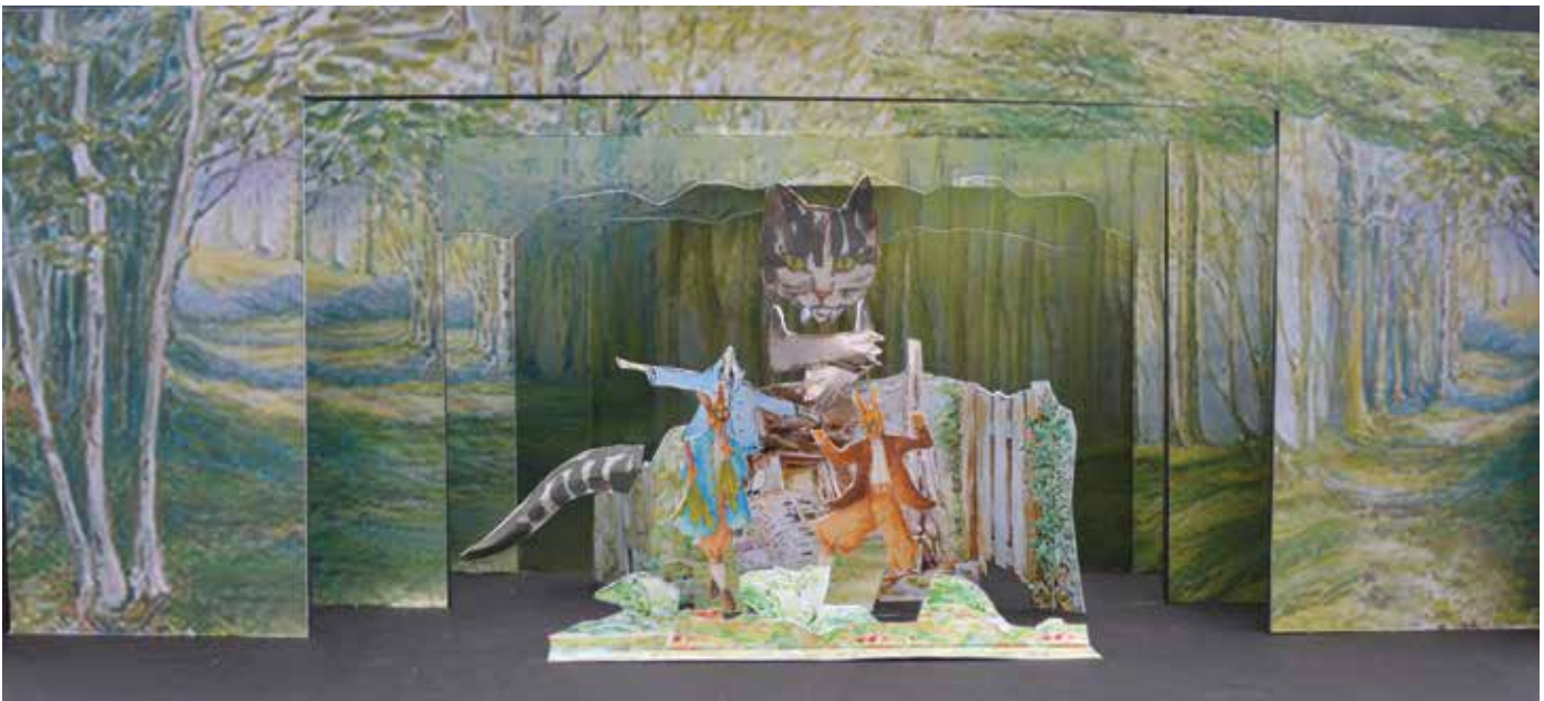
Set model of Mr. McGregor's garden.

Puppets are similar to the mask in their fascination and power. We accept that this carved being is real and alive, and we invest it with an intensified life of our own imagining. Thus, puppets can take an audience further and deeper into what is true. Audiences bring more of themselves to mask and puppet theater because they are required to imagine more. Masks and puppets live in a world of heightened reality. Used with art and skill, they can free the actor and the audience from what is ordinary and mundane, and help theater do what it does at its best: expand boundaries, free the imagination, inspire dreams, transform possibilities, and teach us about ourselves.