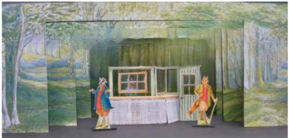
Set model of Mr. Tod's house.

In its home city, Enchantment has reached audiences of about 20,000 per year through its innovative and imaginative presentations of literary classics for children. Its newest program, Enchantment Everywhere , was started in the spring of 2014, and takes completely portable productions directly into school auditoriums, community centers and local venues – anywhere children and families gather - providing free tickets to thousands of children. On tour across the United States each year, the Company reaches more than 150,000 people in 35-40 states. Based on extensive experience, about 80% of the Company's touring audience is comprised of children from 5-12 who delight in the company's fantastic life-size puppets, skilled masked actors, original music, and startling feats of magic and illusion. It is to their infectious laughs, astonished gasps, and enthusiastic applause that Enchantment is dedicated.