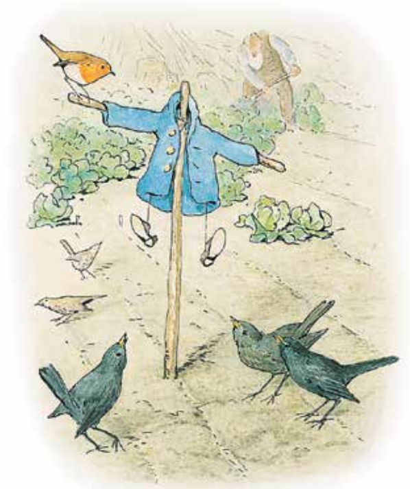
Peter's jacket on the scarecrow