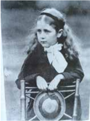
Picture of a young Beatrix