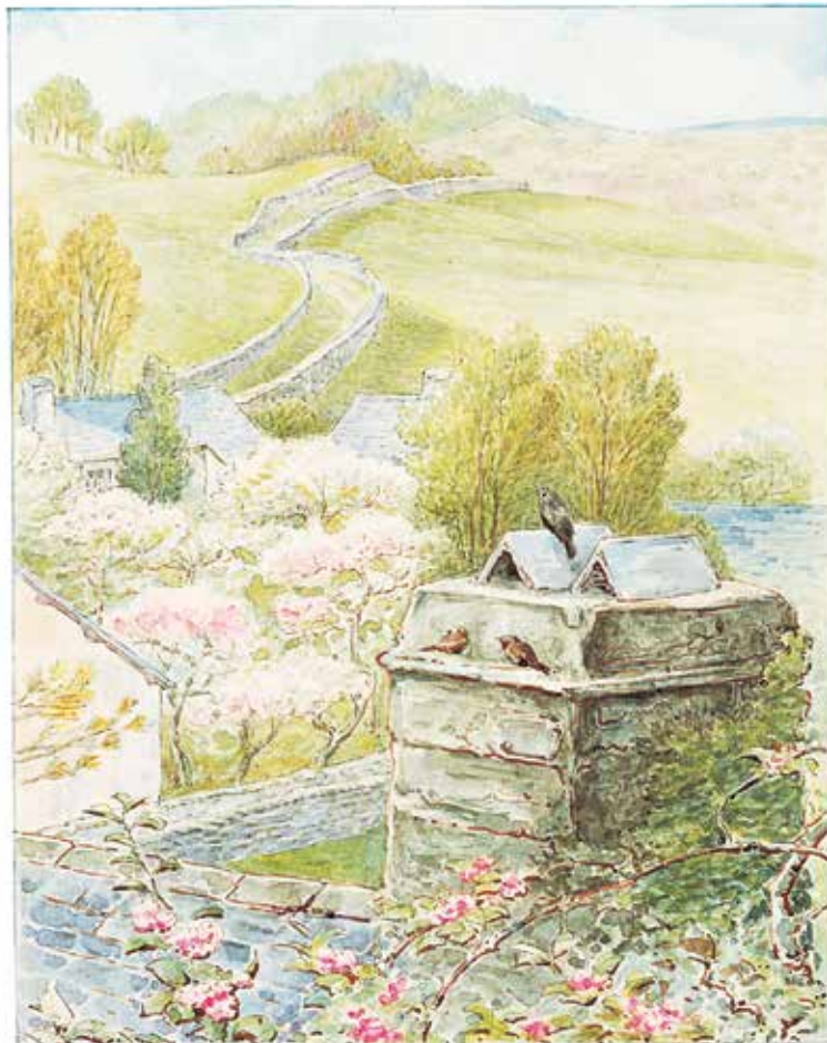
Rooftop view from Hill Top Farm from The Tale of Samuel Whiskers